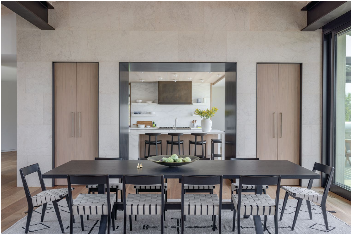
From top: Contrasting lines from the imposing table by Fern, the Knoll chairs, the Merida rug strike a balance in the dining room; a pop of color in the kitchen.