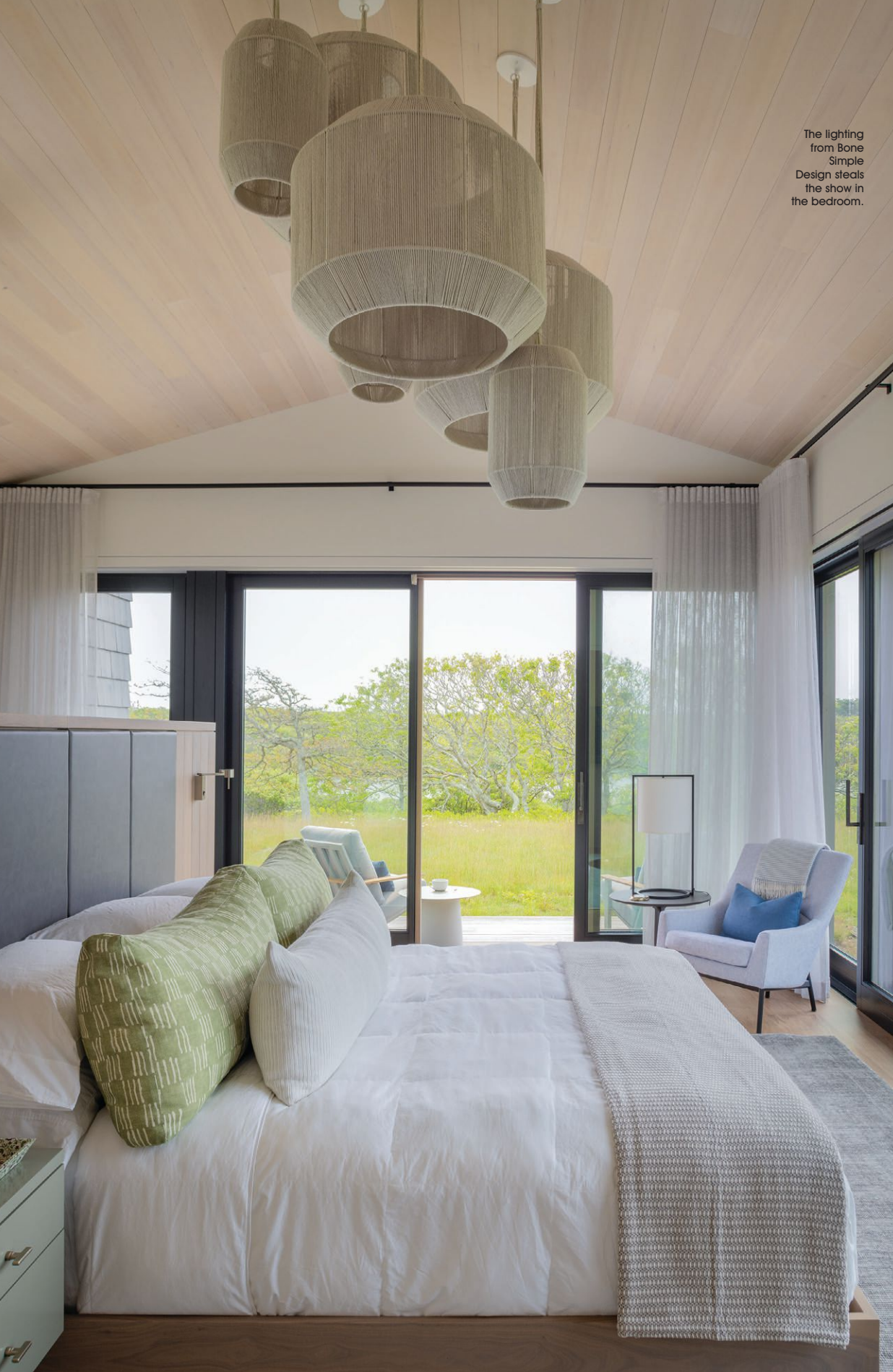
The lighting from Bone Simple Design steals the show in the bedroom.

four predominant ingredients: Alaskan Yellow Cedar, walnut, limestone and patinated steel,” explains Tom Shockey, the project’s designer and manager. “They’re all very sophisticated, clean, cool-toned materials. The way the exterior-to-interior experience played with these materials almost takes a backdrop to the changing landscape coloration.”